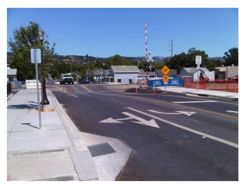
No attempt to restrain or guide the public from entering the construction site