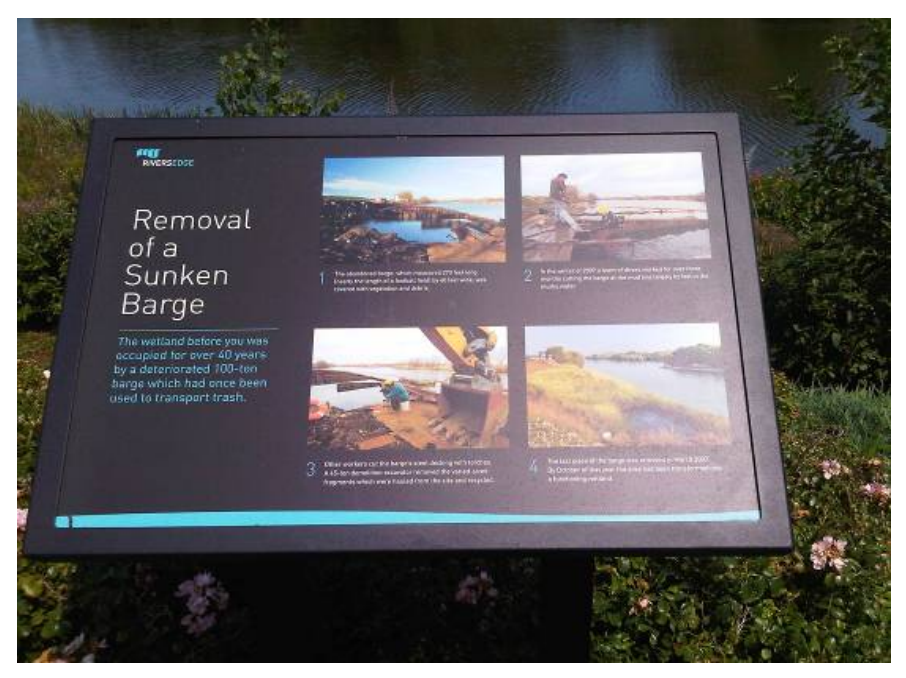
Plaque detailing the works involved in improving the banks