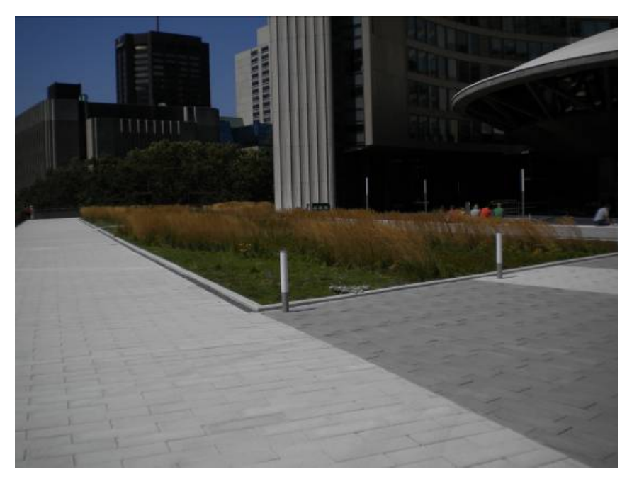
Green Rooftop above the City of Toronto's Council Building