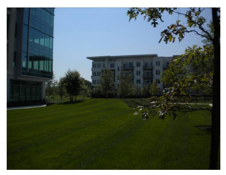
Landscape to housing area