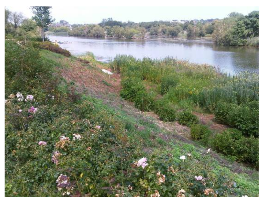
Natural barrier of prickle bushes to keep people from entering the water which was still contaminated from previous multiple years of abuse