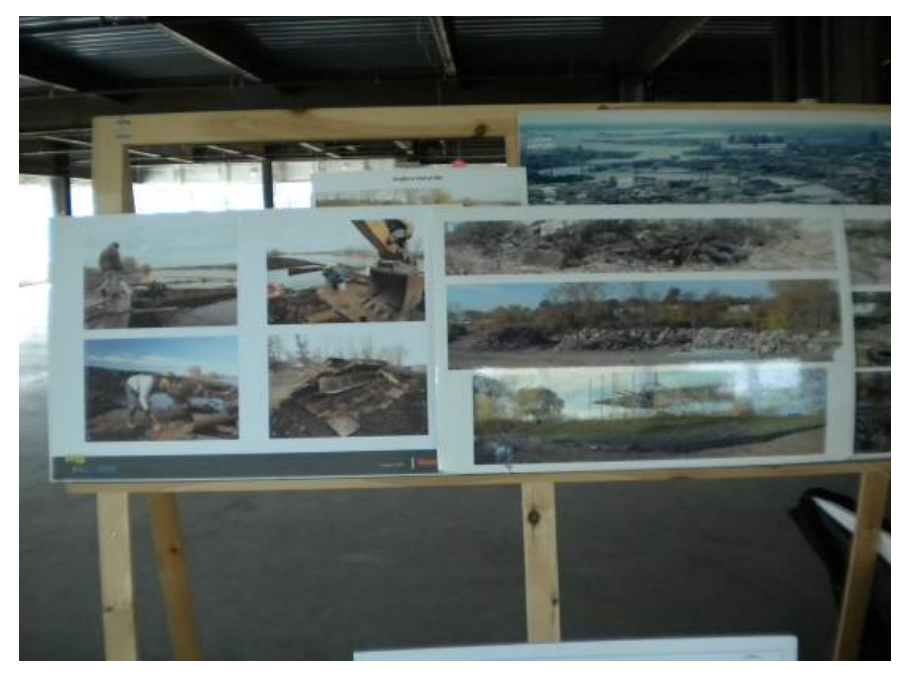
Pre construction and during construction photos