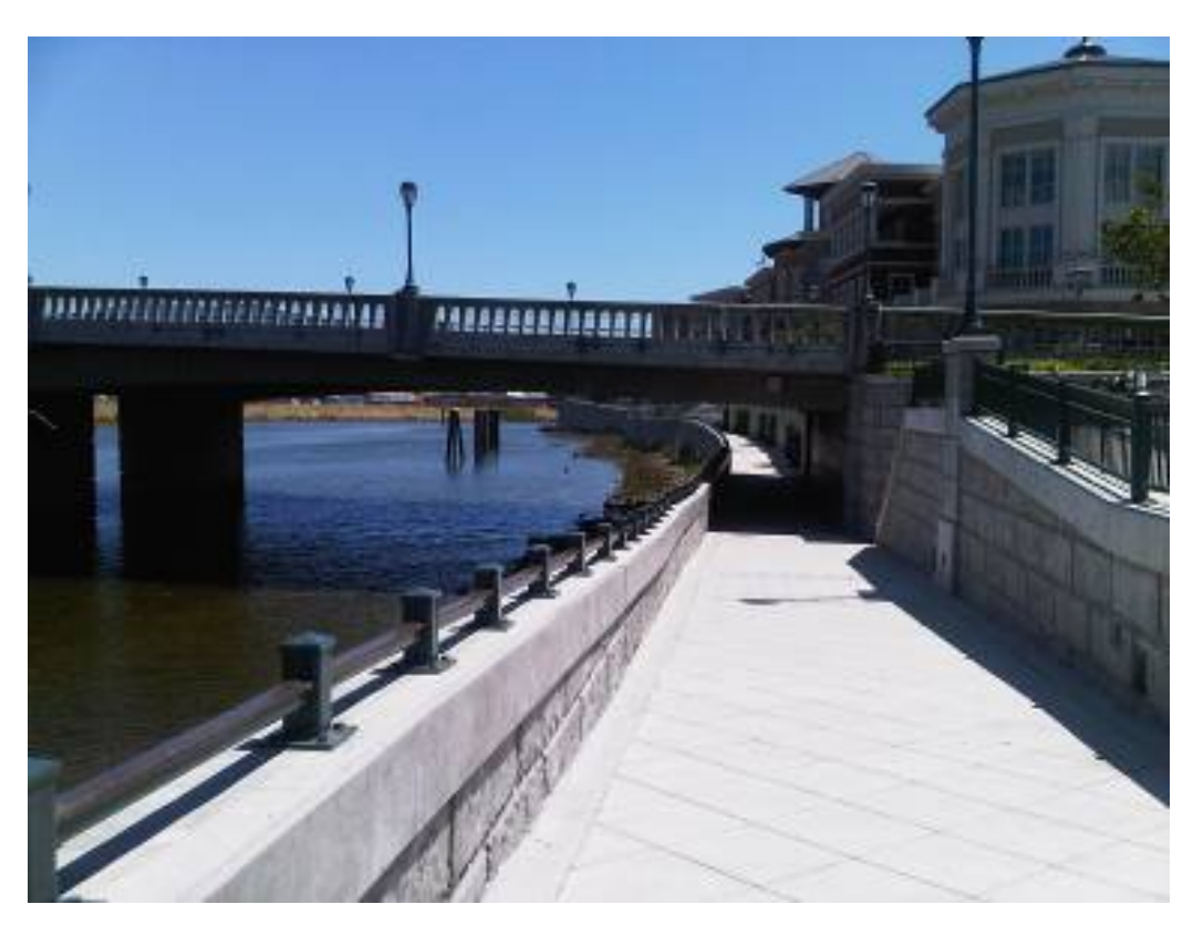
Flood wall turned into a landscape feature used to beautify the city