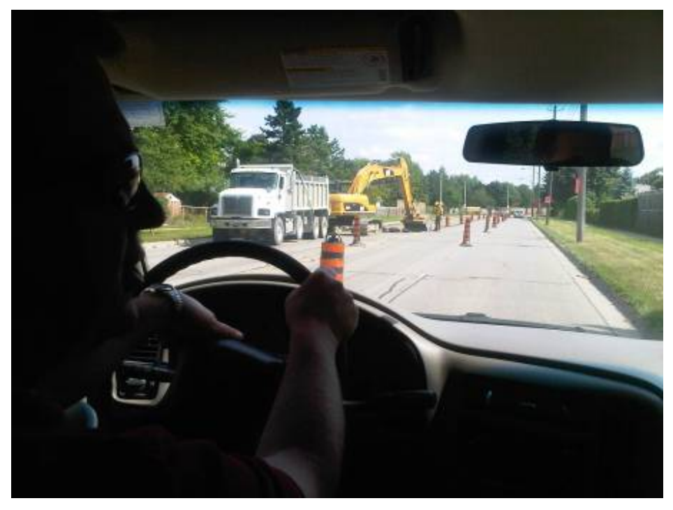
Another example of construction traffic management

Stormwater is becoming a big issue across all states – the question on how to manage and recover costs. Waterloo is now applying rates to charge for stormwater. Is this a direction for Australia? At current, councils in Australia do not recoup any revenue from owners tapping into their assets. In the US stormwater is a major problem in congested areas due to the impact that industrialisation and urbanisation has on the water balance. JHL Civil has constructed a number of stormwater harvesting projects for clients that have proactively sought funding to cover the capital costs of the infrastructure. We see this as an area worth developing. This will require leadership and collaboration of the CCF, suppliers, clients and contractors to encourage municipalities to take on pilot programs that can trial innovative products.