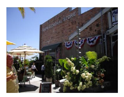
A good location for lunch – the old Napa Mill