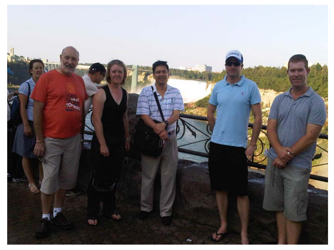
Whilst we took in the opportunities to learn, we also enjoyed the locations & the travel